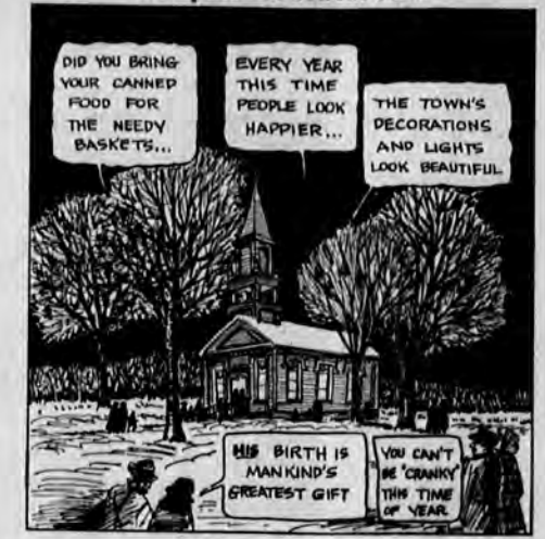
THE TOWN'S DECORATIONS ARE LIKE THE OLD BEAUTIFUL...