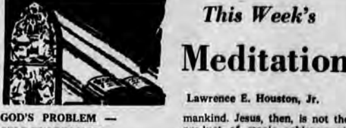
THIS BIRTH IS MANKIND'S GREATEST GIFT...