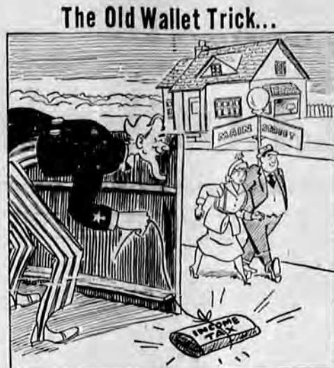
The Old Wallet Trick...