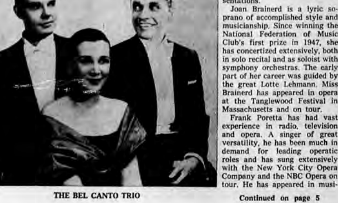
THE BEL CANTO TRIO Continued on page 5