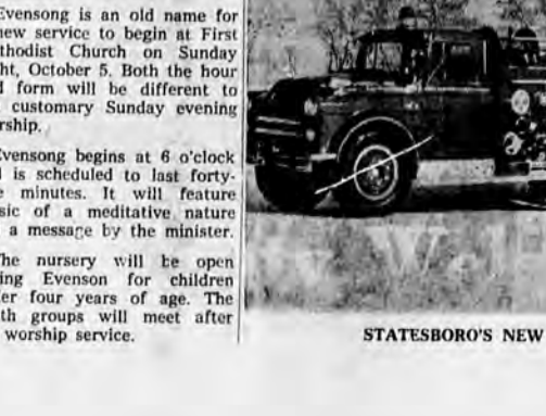
STATSBORO'S NEW FIRE TRUCK