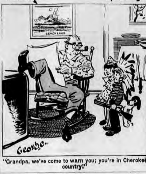
George "Grandpa, we've come to warn you; you're in Cherokee country!"