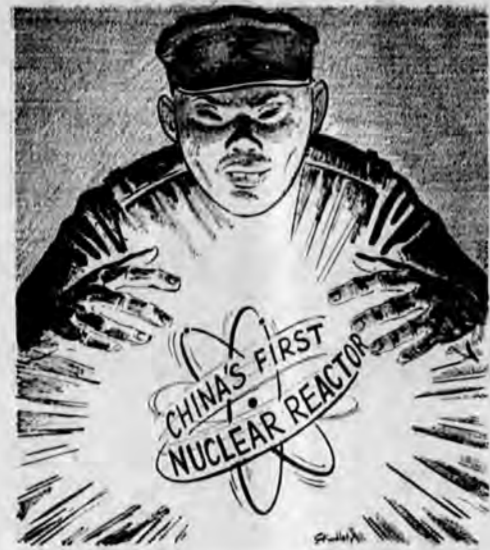
China's first nuclear reactor is being built near Peking, according to reports.