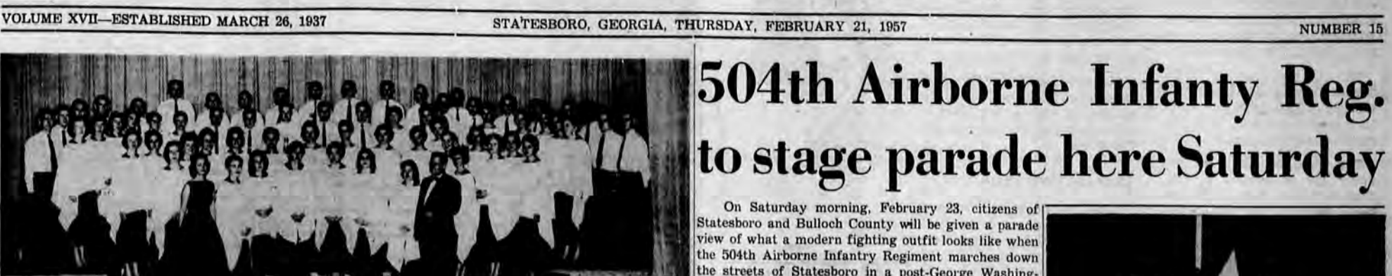
THE G.T.C. PHILHARMONIC CHOIR will make its first public appearance of this quarter early in March at the First Methodist Church in Statesboro, Georgia.