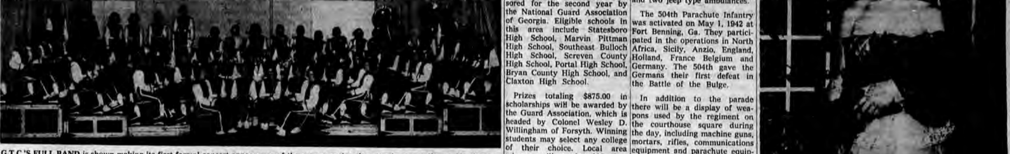
G.T.C.'S FULL BAND is shown making its first formal concert appearance of the year, sporting the group's new uniforms.