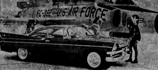
AMERICA'S two famous "Lancers"—the Air Force's new F102A jet plane and Dodge's trim 1957 hardtop—stand poised for action at the Duluth Air Force Base, where the world's first supersonic jet weather interceptor plane guards the northern air frontier.