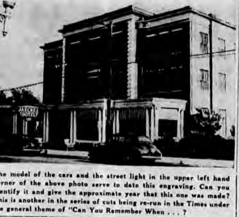
The model of the car and the street light in the upper left hand corner of the above photo serve to date this engraving.