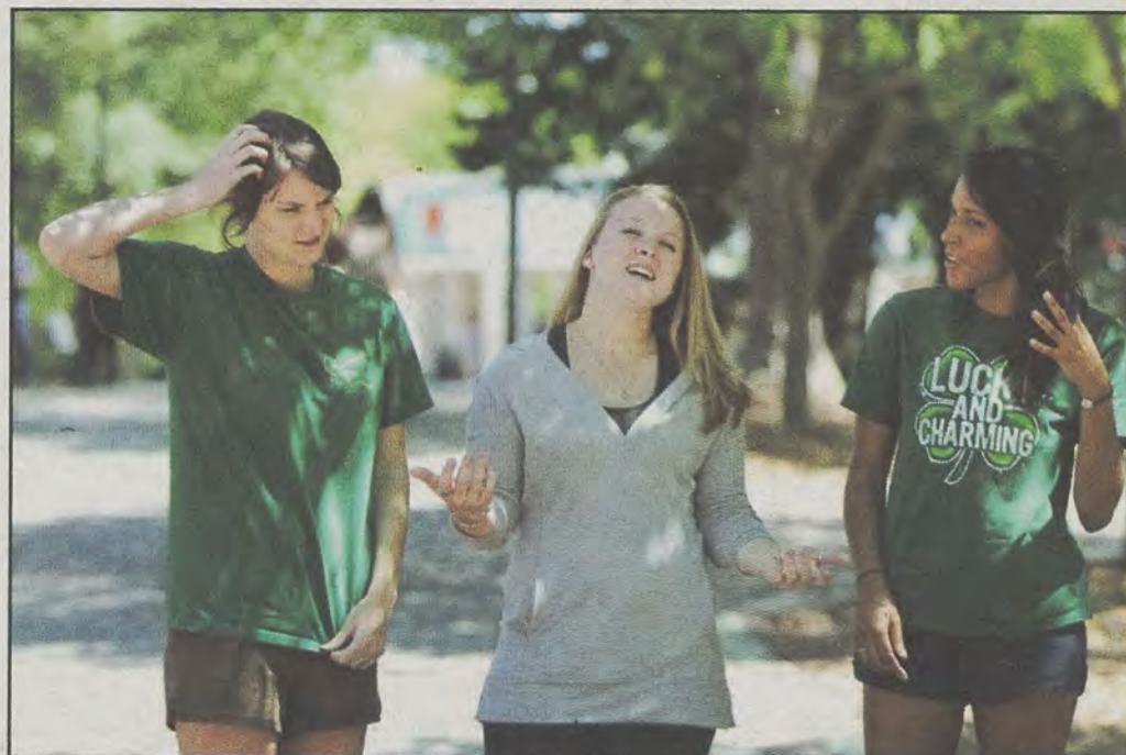
Lindsay Hartmann/The George Ain't

When asked what SGA is or even what it stands for, the results were less than pleasing.