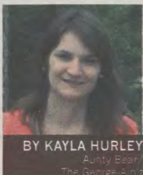
BY KAYLA HURLEY Auntie Bear/ The George-Anne

Eagle Alerts investigated during the flux of alerts issued via student cell phones, helpful or just plain annoying?