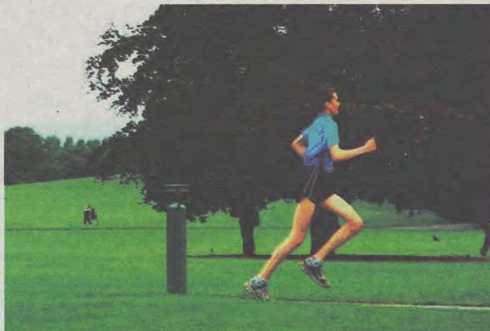
This photo has nothing to do with anything else in the newspaper. Our hope is that you will be disheartened about what you missed out on in previous days and we encourage you to go to more events to get your own damn pictures. Enjoy.