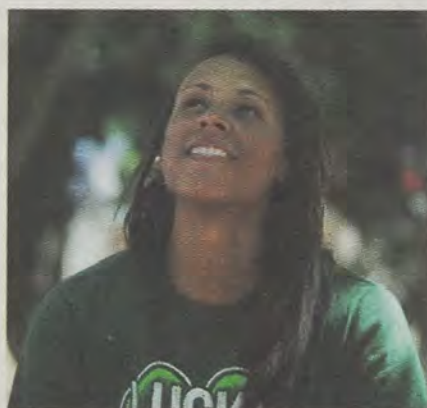
This is the face of ignorance.