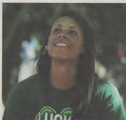
This is the face of ignorance.