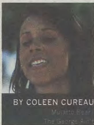
BY COLEEN CUREAU Muratto Bear The George Ain't