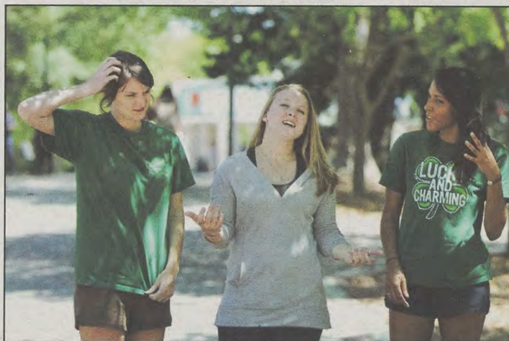
Lindsay Hartmann/The George Ain't

When asked what SGA is or even what it stands for, the results were less than pleasing.