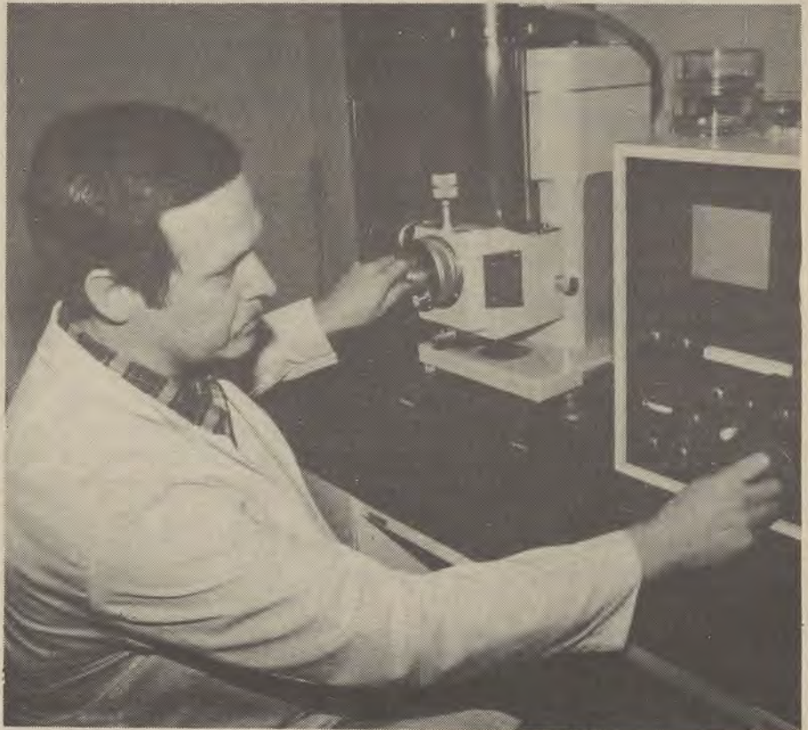
GSC's electron microscope will be one of the demonstrations presented at the meeting of the Georgia Academy of Science.