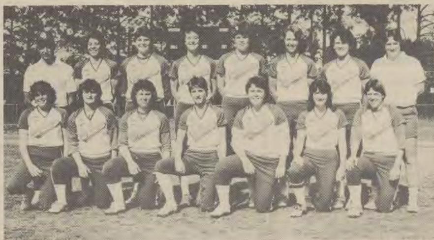
1984 Georgia slow-pitch champs—GSC Lady Eagles.

The tournament victory gave the Lady Eagles a good start on their preparation for the national slow-pitch tournament to be held in Tampa, Fla. May 3-5.