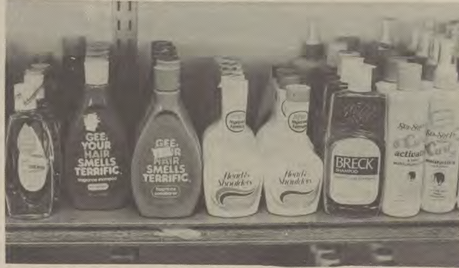
These products are beneficial to help summer-dried hair get back in top shape.

also help combat the problem. To help control oil buildup, rinse this recipe through your hair once every two weeks.