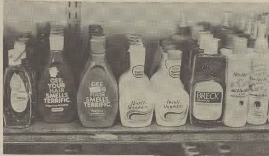
These products are beneficial to help summer-dried hair get back in top shape.

also help combat the problem. To help control oil buildup, rinse this recipe through your hair once every two weeks.