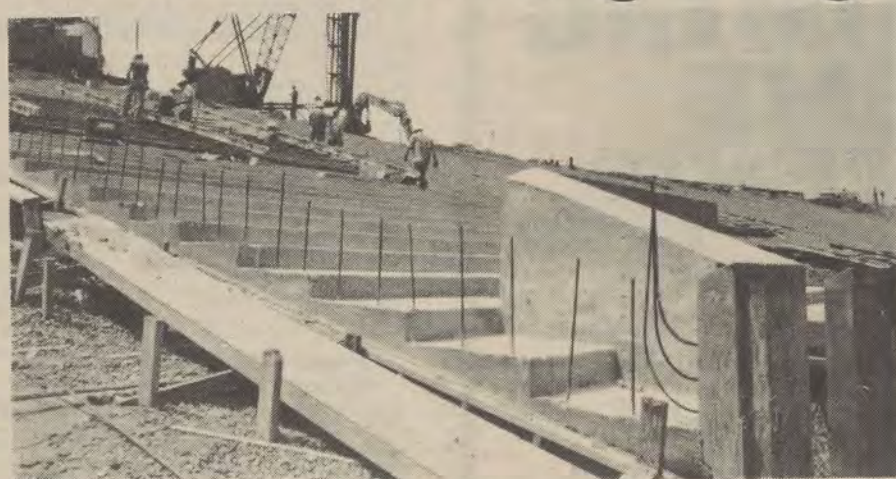
Stadium construction was halted temporarily due to unfavorable weather conditions.