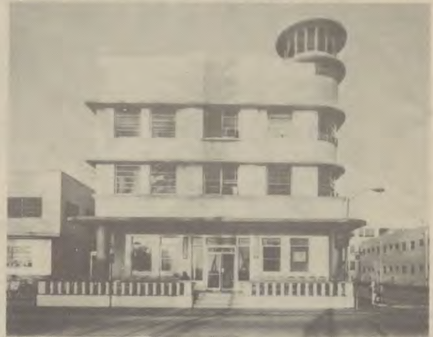
The Architecture and Design of Old Miami Beach. Laura Cerwinske. Photographs by David Kaminsky. (Rizzoli, $14.95).

The exhibition is being shown in Gallery 303, third floor of GSC's Foy Fine Arts Building. Viewing hours are 8 to 5 p.m., Monday through Friday.