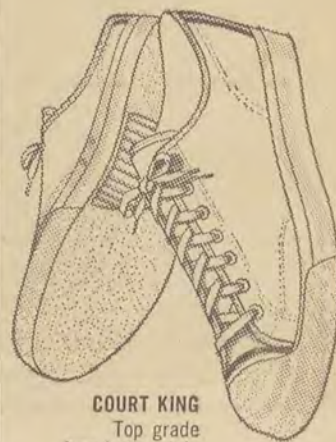
COURT KING Top grade lace-to-toe style

Two Great Shoes for future "pros". Suitable for any court — or wearing anywhere!