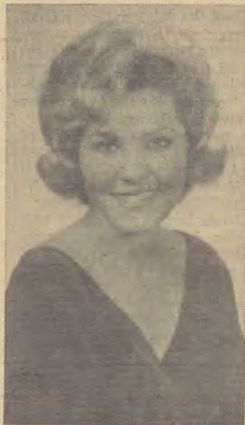
All Doubts Removed Carson's Really Coed