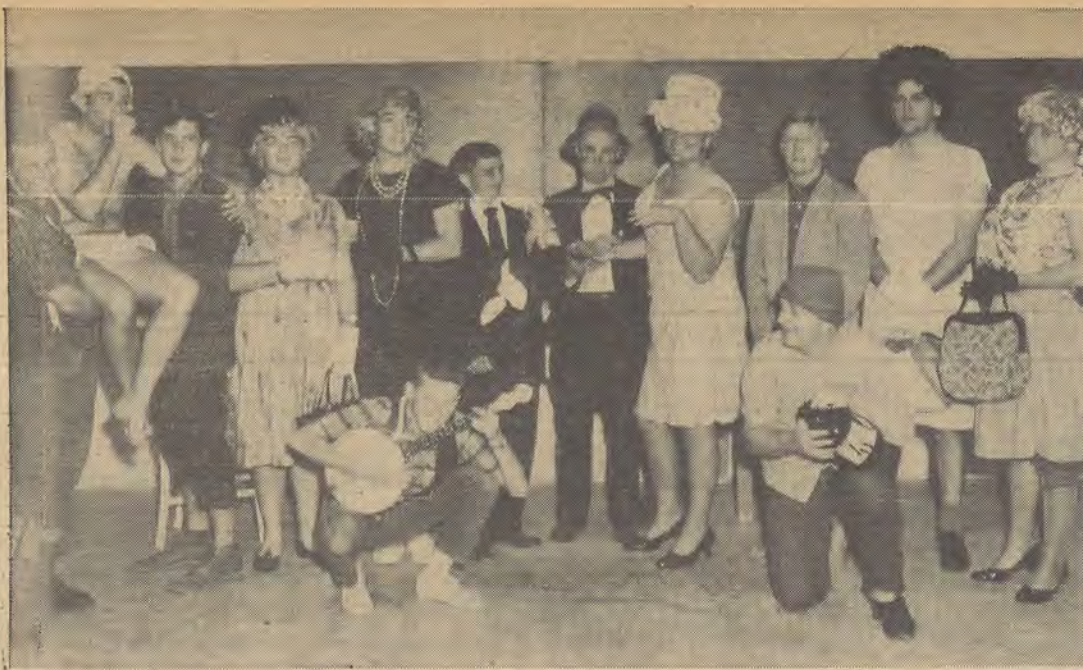
Delta Pi Alpha Crew Gathers For Family Portrait In Womanless Wedding . . . . Comedy Will Be Given Tuesday In McCroan; Will Also Feature Faculty