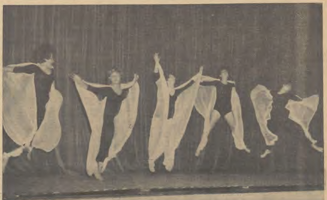
SOUTHERN'S MODERN DANCE GROUP LEAPS HIGH IN VARIETY SHOW . . Routine Will Be Featured In 'Son of Vaudeville' In Last Performance Tonight