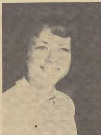
"Student of the Week"