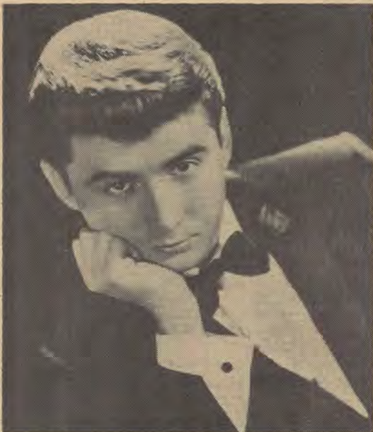
MGM Recording Star Johnny Tillotson Will Be Here With Dovells May 5