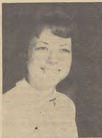
"Student of the Week"