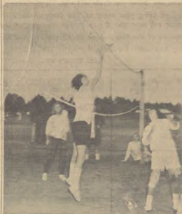
FIRST HALF IM CHAMPIONS IN ACTION

Just Received 100 PAIRS of APACHE MOC'S For Men BURTON'S