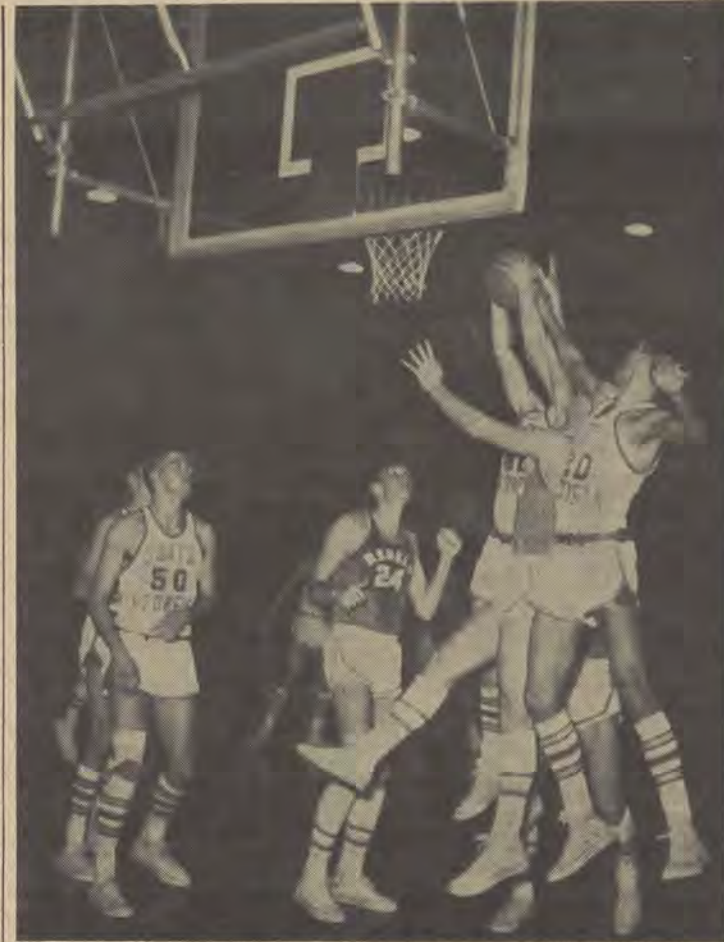
SOUTH GEORGIA AND COLUMBUS COLLEGE battle for a rebound in last Saturday night's clash for the state Junior College championship. The Tigers of SGC won the annual affair with a unquestionable 81-62 victory over the Rebels from Columbus.