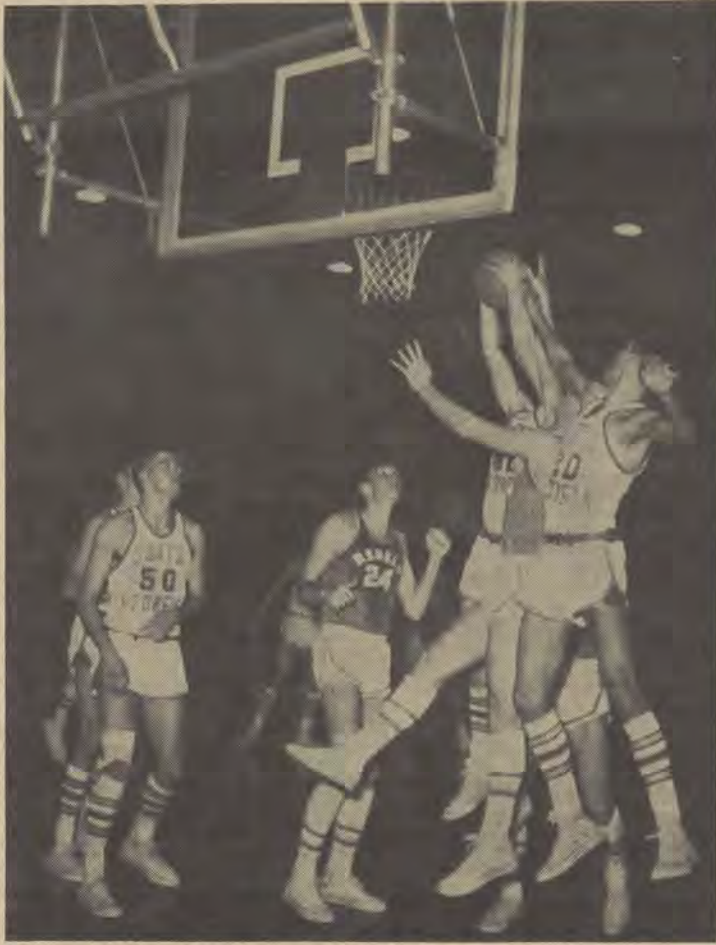
SOUTH GEORGIA AND COLUMBUS COLLEGE battle for a rebound in last Saturday night's clash for the state Junior College championship. The Tigers of SGC won the annual affair with a unquestionable 81-62 victory over the Rebels from Columbus.