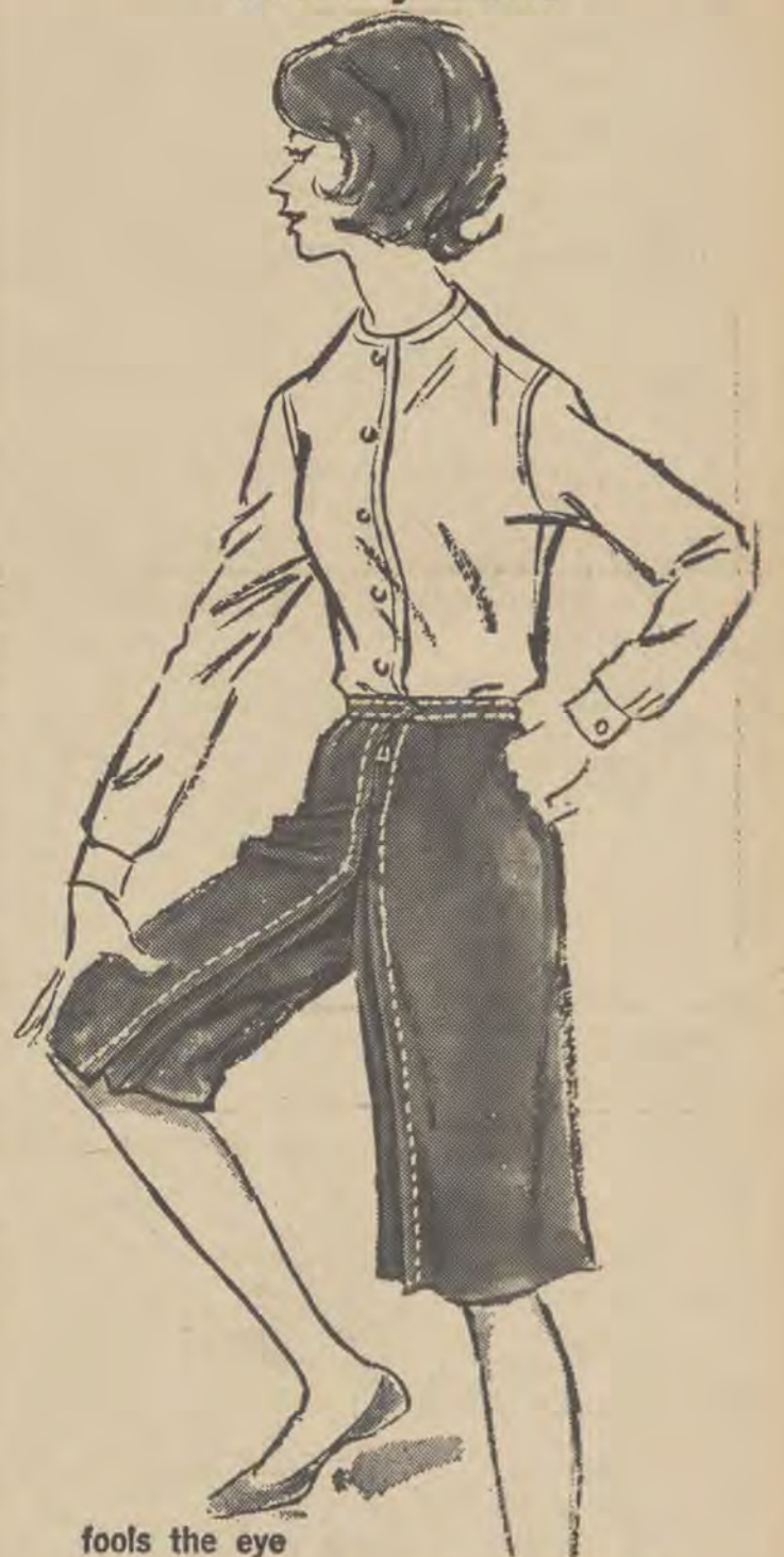
fools the eye

The Culotte looks like a slim skirt standing still, with free comfort for motion... and a joy getting out of a low-slung car! 65% Dacron* Polyester, 35% cotton poplin. Navy only. Sizes 5-15.