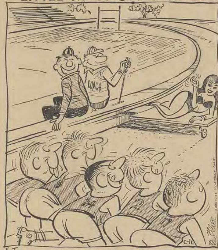
I THINK WE'RE TRAINING THE NUMBER ONE TRACK TEAM IN THE NATION, COACH.