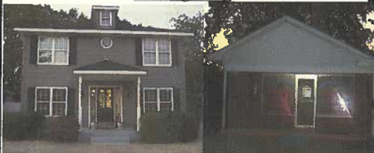
Formerly Cowart Barbershop