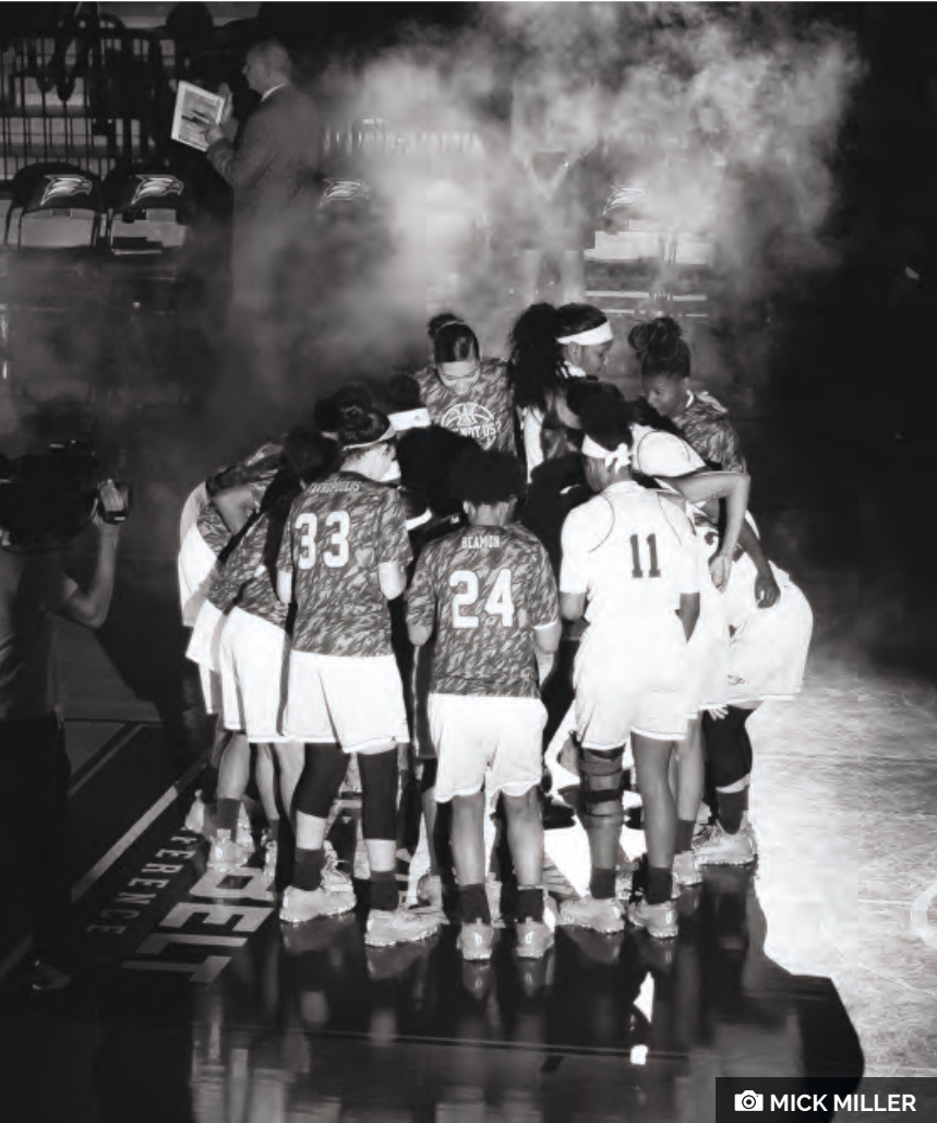
The GS women's basketball team huddles to get pumped pregame. They play Arkansas State Tuesday in their first game of the Sun Belt Tournament.