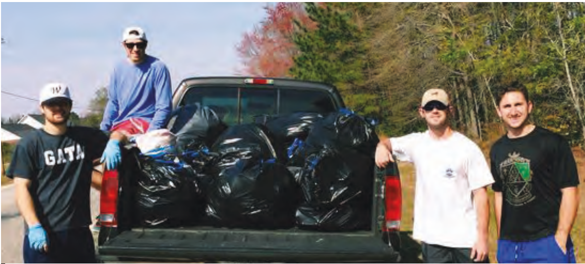
#ProjectCupS, also known as Project Clean Up Statesboro, met last weekend to clean up parts of Burkhalter Road in Statesboro. The group collected close to 30 bags of trash on Sunday.