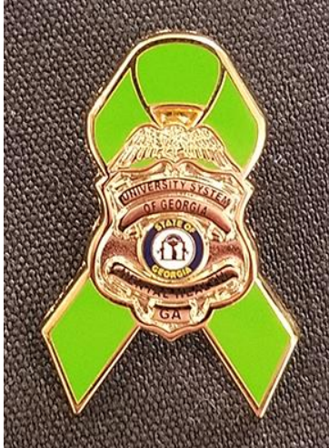
Mental Health Initiative pin

So far, almost 30 police officers at Georgia Southern University have completed the three different training programs, earning each officer a Mental Health Initiative pin.