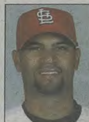
Albert Pujols (STL) 2009 Season Stats