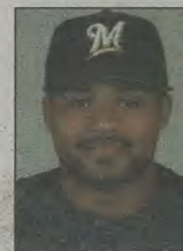
Prince Fielder (MIL) 2009 Season Stats