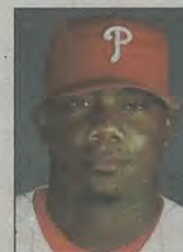
Ryan Howard (PHI) 2009 Season Stats