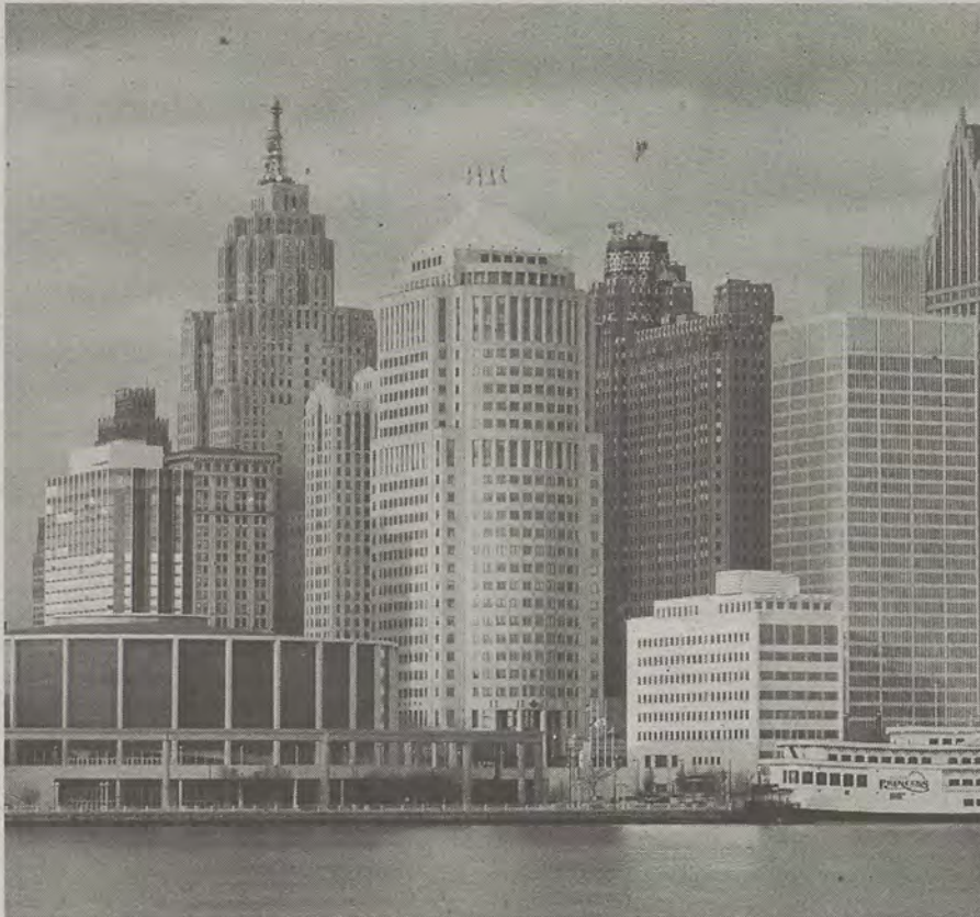
Members of Georgia Southern attended the annual PRSSA convention in Detroit in October.