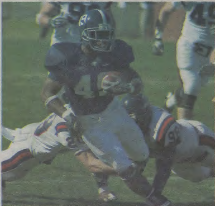
Brett McGonigle / STAFF