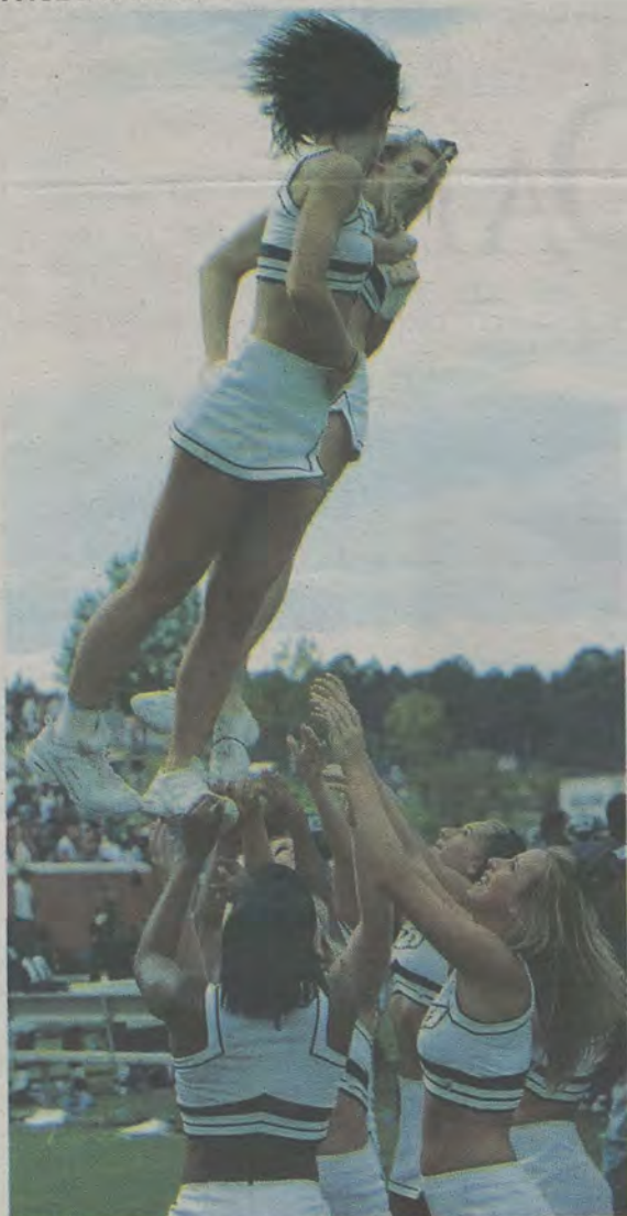
Cheerleaders perform during the 2007 Homecoming football Game.