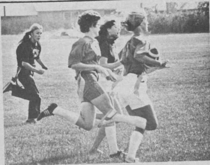
WOMEN'S FLAG FOOTBALL ACTION

The purpose of the "Pirate Preview" will be to create spirit in the student body for the Pirates basketball season which opens in the Shriner's Classic on November 24.