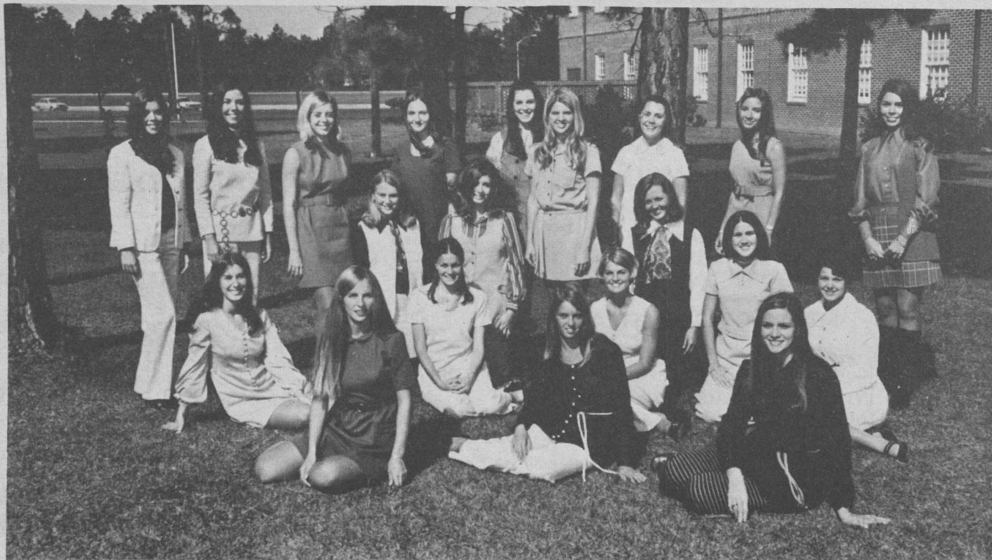
These 21 Armstrong beauties competed for the Miss Geechee Title