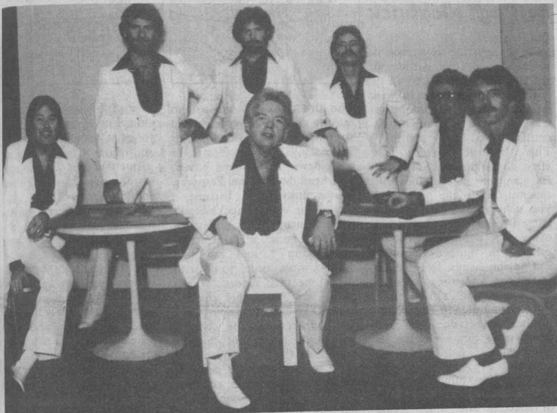
FAT AMMON'S BAND