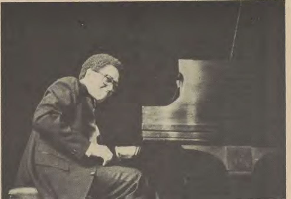
The Billy Taylor Jazz Trio performed "A Suite for Jazz Piano" to an enthusiastic crowd at McCroan Auditorium on April 15. The suite

ment Committee made a fine choice in bringing the trio to GSC. The spectators got what they came for: good, smooth, flowing jazz music. Listening to the music was pleasing to the jazz enthusiast along with the jazz novice. The people wanted to hear Billy Taylor play. "Play it man, play it!"