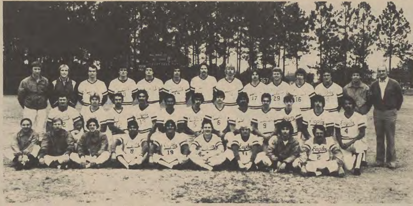
The Georgia Southern 1977-78 baseball team.