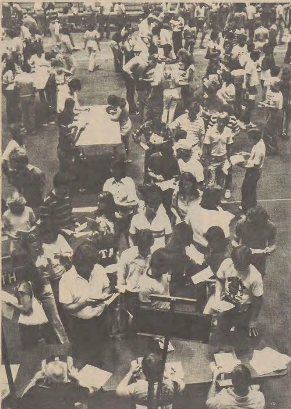
Georgia Southern College students once again enjoyed themselves as they went through registration in the Hanner Fieldhouse. Members of