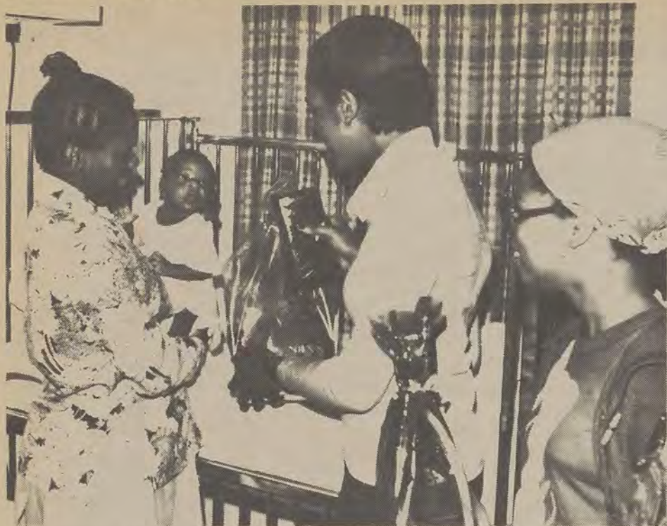
The sorors of the Alpha Kappa Alpha sorority visited the pediatrics ward of the Bulloch Memorial Hospital recently to spread Easter cheer. The group took Easter baskets to the youngsters as a