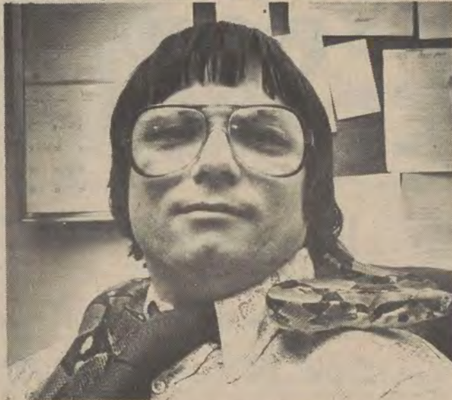
The assistant psychology professor is shown with one of his specimens. "Snakes take at least ten times as long to train as other animals," he said.