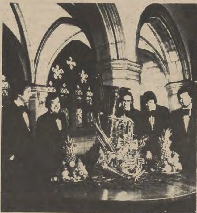
Musical virtuosity, polished showmanship and programs showcasing a treasury of music from Renaissance to contemporary composed for two trumpets, French horn, trombone and the tuba will feature the Eastern Brass Quintet.

Tickets for the performance can be picked up at the ticket office on the second floor of Rosenwald. Students must show their identification card, but pay no fee.