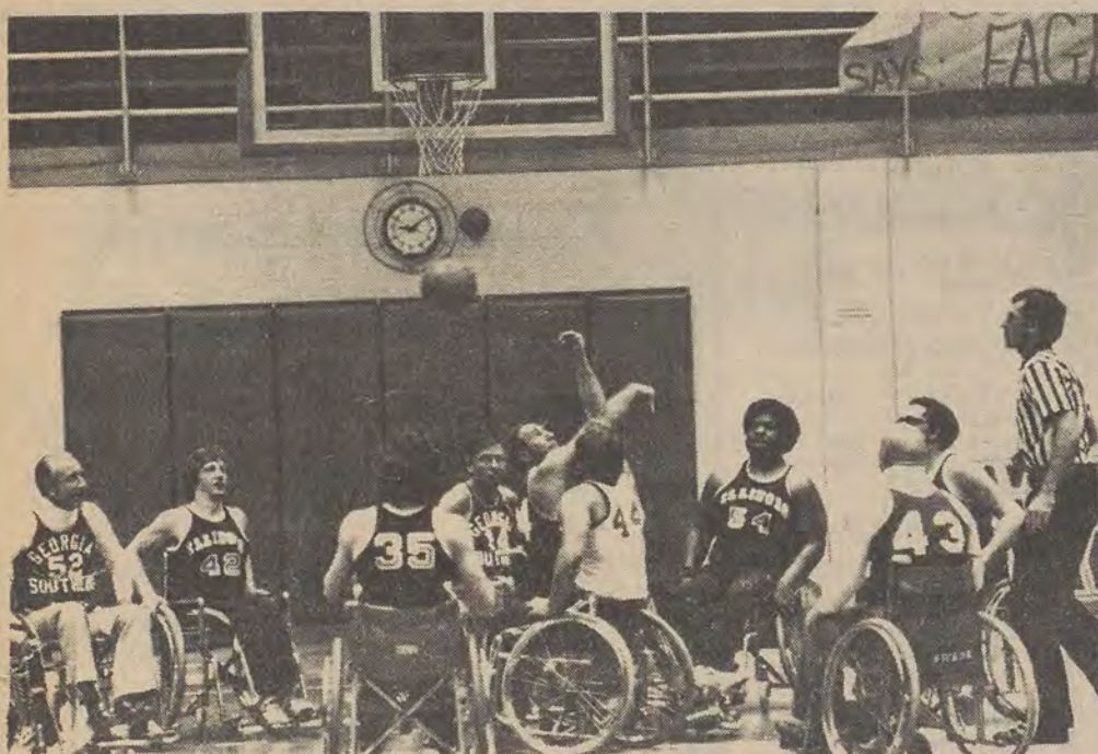
The Gizz Kids, National Wheelchair Champions, performed in the Hanner Field House last Monday Night.

The Gizz Kids started 30 years ago and have participated in 20 out of 29 National Wheelchair Basketball Association tournaments, taking the title in 1953, 1969, and 1970. They finished second four times and third four times. This record is unmatched by any of the 200 teams in the association.