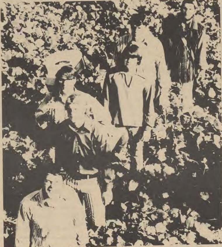
JESUS PEOPLE TO APPEAR MAY 30 AT FOY

Sunday night for their final concert of the year. During the past two quarters the J.P. have played for