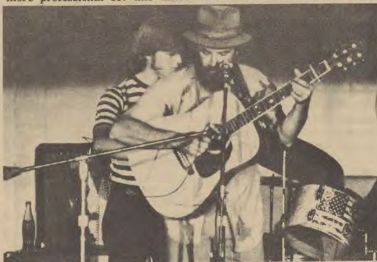
Goose Creek Symphony

It was the hand clappingest, foot stompingest best, biggest and most happy party I've ever been to. Great gobs of superlatives and dangling prepositional phrases (split infinitives?)—the Union Board is crazy if they don't book these two groups again, real soon.