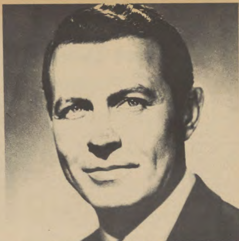
Former Gov. CARL E. SANDERS

A keynote address by former Governor Carl E. Sanders will highlight tomorrow's "E-Day" activities. For a capsule review of the Environmental Action Day and a preview of Sander's speech—see the SECOND FRONT.