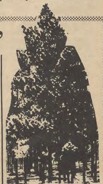
A GTC Pine