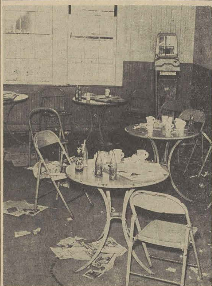
GTC'S "LITTLE STORE," as seen after a normal whirlwind of student "relaxation." The fun and friends to be had here seems to make the place a refuge for lost souls caught mercilessly in the wheels of learning. (See editorial on page two).