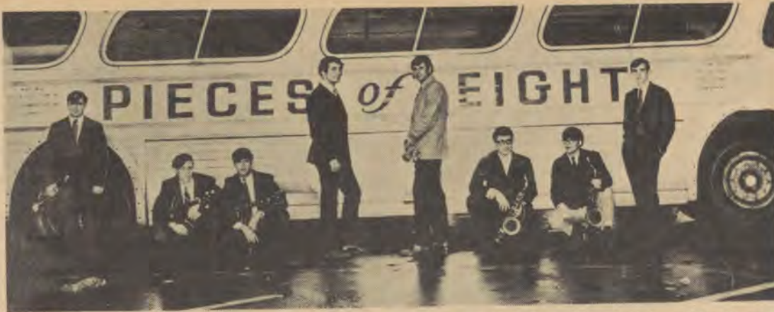
The Pieces of Eight, popular singing group from Greenwood, S.C., will entertain at the Spring Swing dance sponsored by IFC on Saturday, May 2. They are known for their hit "Lonely Drifter." The dance will be held in the Hanner Gym from 8-12 p.m. Admission is $2.00 in advance and $2.50 at the door, per person.

Nader's fight against dangerous conditions in McCroan was over and he was headed back to Savannah to meet his plane. As he left the shakey structure, he had this to say about the building: "My next book will be entitled UNSAFE UNDER ANY CONDITIONS. I suspect that as soon as it is published, 15,000 auditoriums will be recalled by their manufacturers."