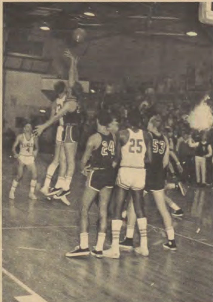
Southern's Eagles get crucial tip in last minutes of play.

P.S. The cheerleaders would like to thank Sigma Nu for the Bon Fire and pep rally that they held last week.