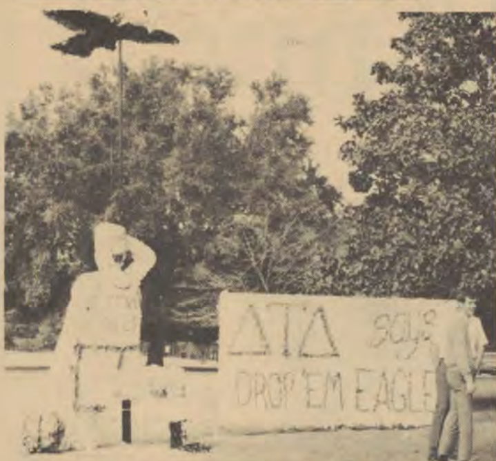
FIRST PLACE WINNER IN DISPLAYS

Delta Tau Delta's "Drop'em Eagles" display won first place in display competition Homecoming Weekend.