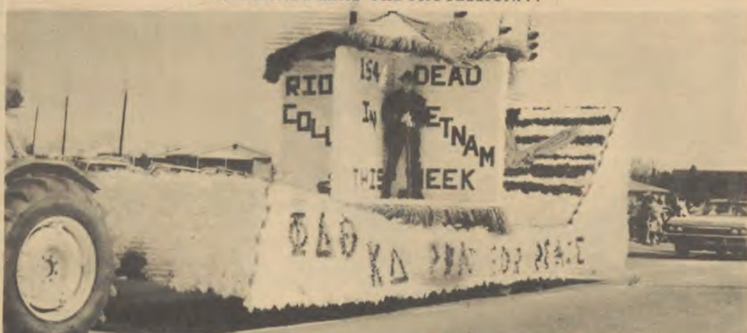
AND THE FLOATS CONTINUED THE HOUR LONG HOMECOMING PARADE