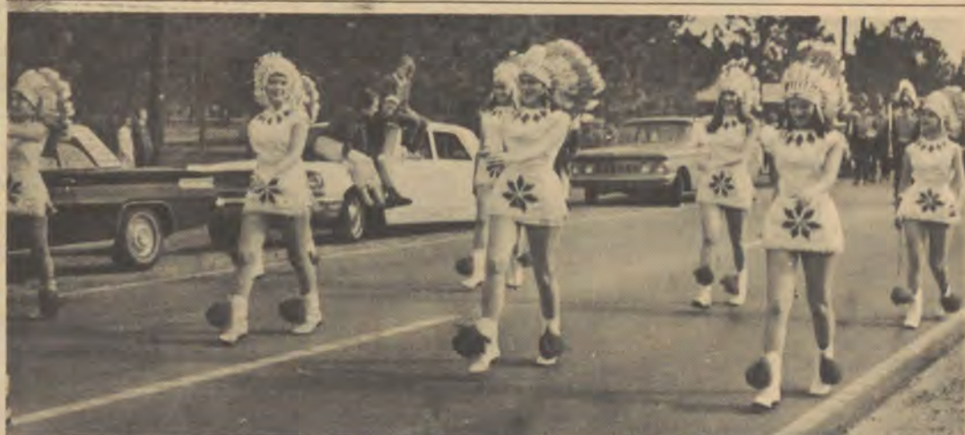
THE BANDS LEAD THE PROCESSION...