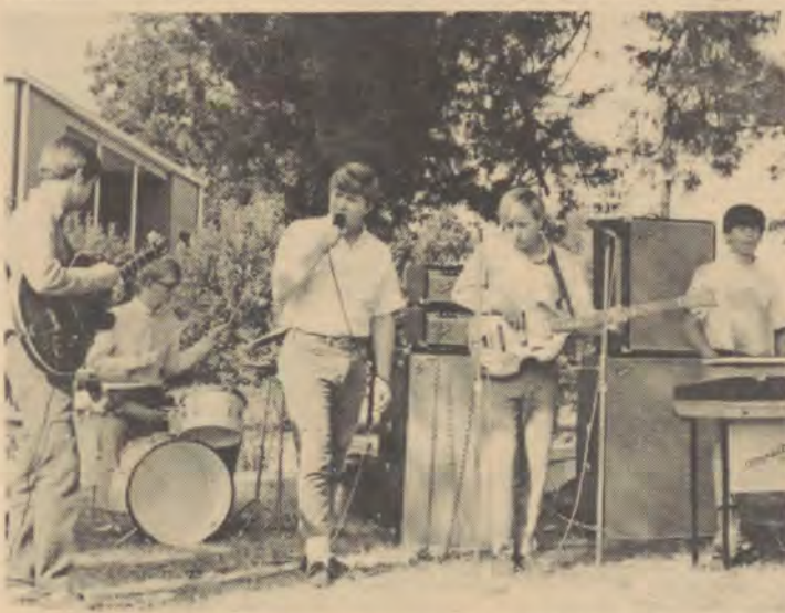
"WAIT 'TIL THE MIDNIGHT HOUR"

The "Dark Side" played between classes Monday in an effort to stimulate interest in class elections.