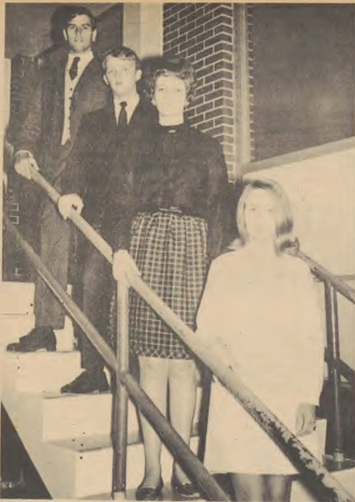
YOUNG REPUBLICAN OFFICERS