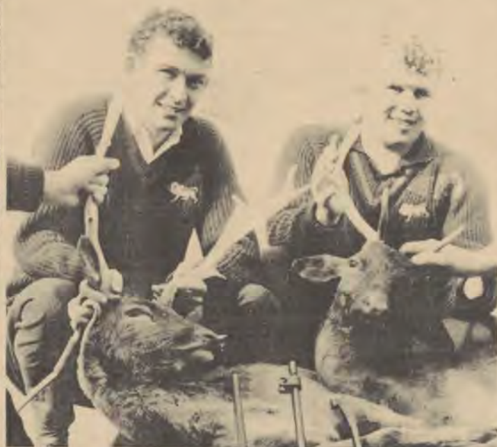
Two members of the British Isles Rugby football team which toured New Zealand recently (and got thrashed by New Zealand in all four internationals) proudly pose with two small but healthy young fallow stags they shot just outside the author's hometown of Wanganui in the North Island.

of nights sleeping under a rock (with no fear of snakes because there aren't any) and is rewarded with a take of a couple of healthy red deer—this is the life.