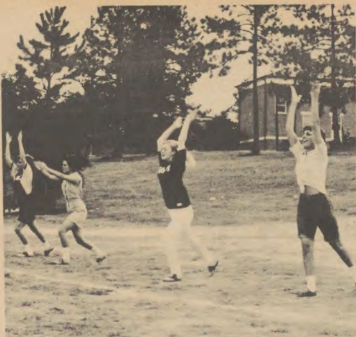
Sore muscles, stiff backs, characterized first day of practice.