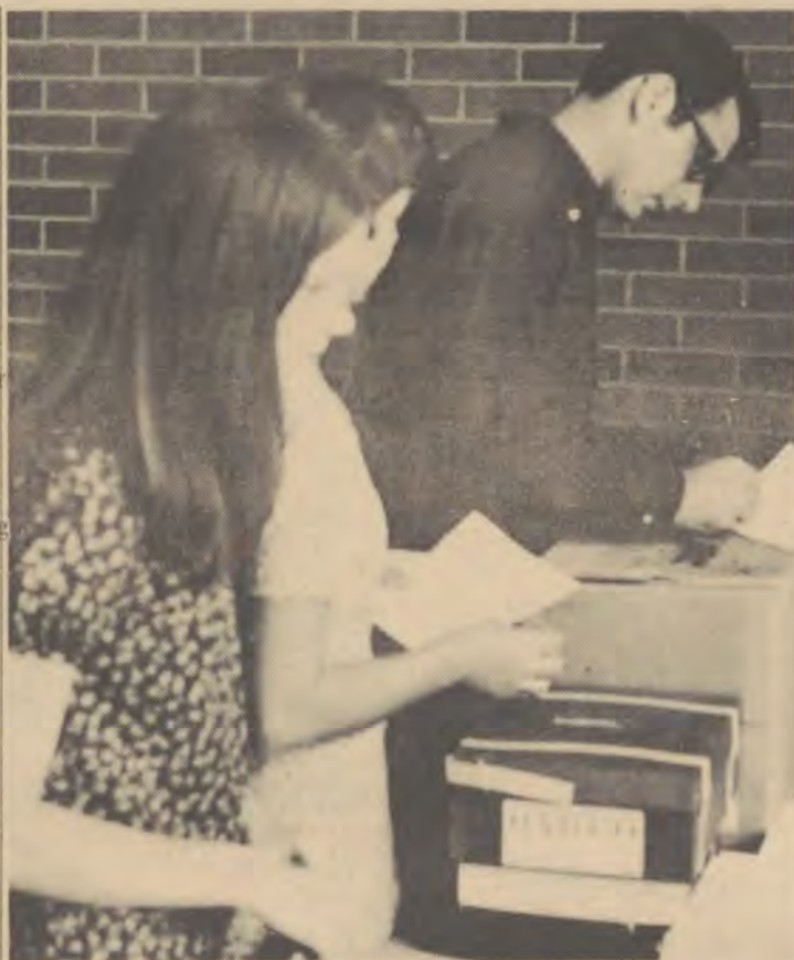
CIRCLE THE NAME ON THE BALLOT

Approximately 2,300 students voted Monday in class elections. Voter turn-out was light, according to Student Association tallies.