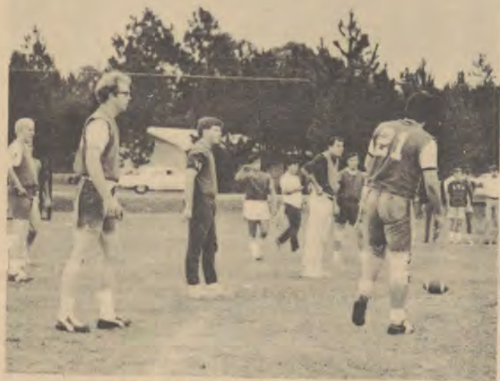
Phi Delta Theta's strong defensive unit