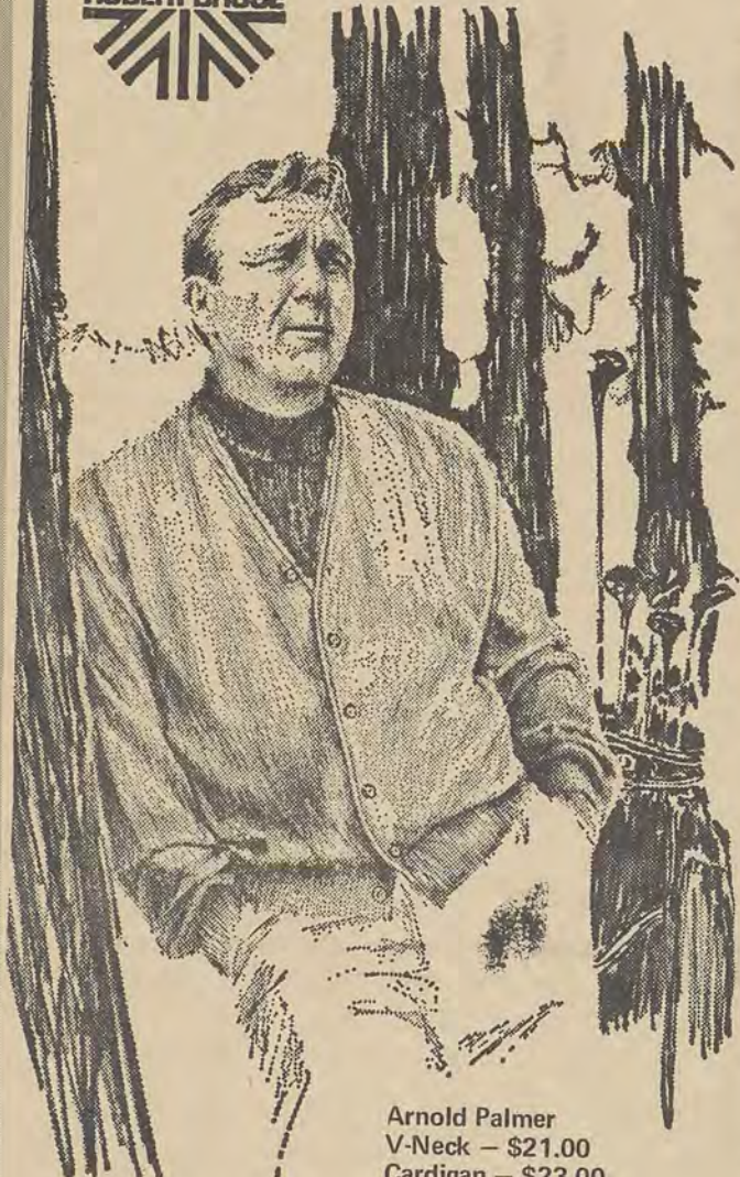
Arnold Palmer V-Neck - $21.00 Cardigan - $23.00