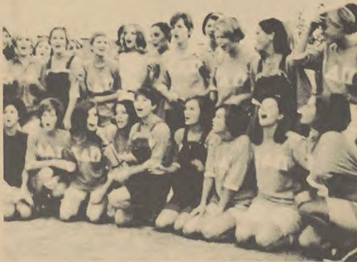
Champions Alpha Delta Pi