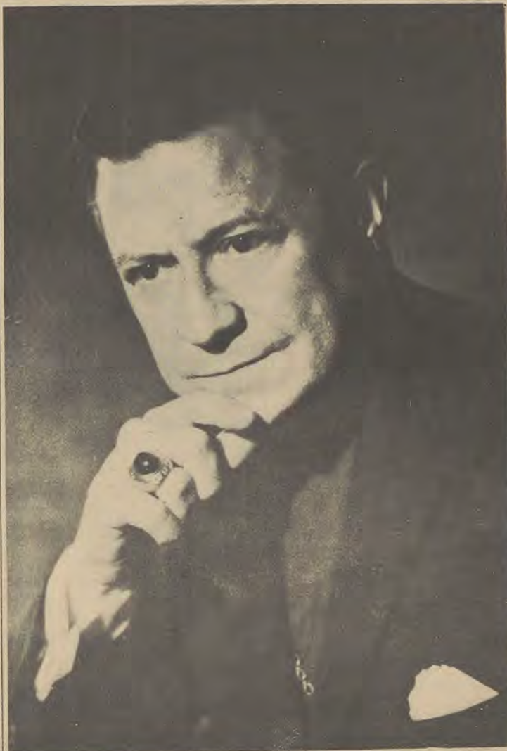
BISHOP JAMES A. PIKE

Art Exhibition Schedule .page 2 Republican Rally . . . . .page 3 Editorials . . . . .page 4 Faculty Forum . . . . .page 5 Candidates . . . . .pages 6-9 Sports . . . . .pages 10-12