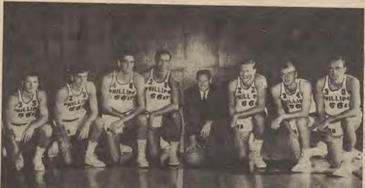
PHILLIPS '66 OILERS