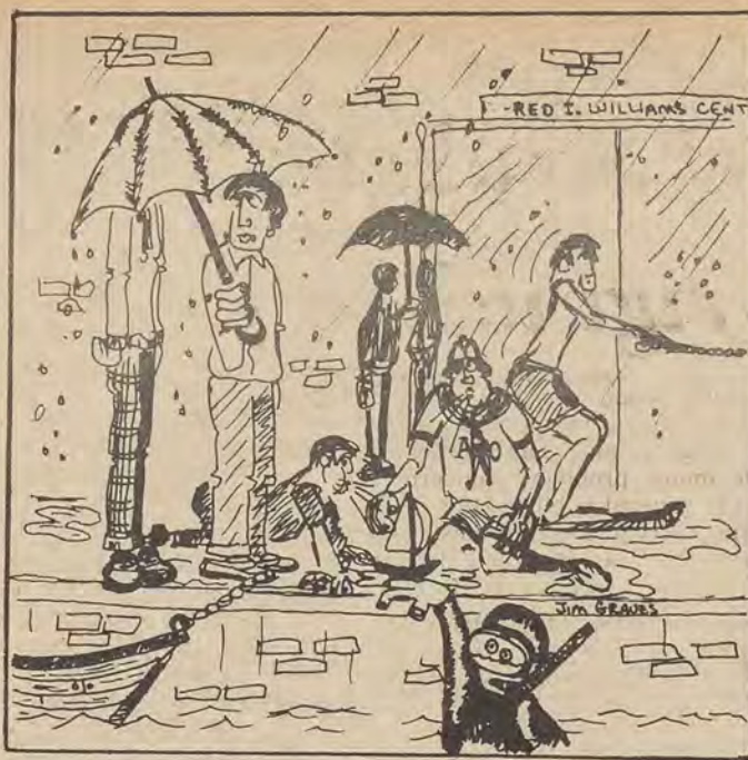
AT SOUTHERN - WHEN IT RAINS IT POURS

With the growing size and complexity of the campus, a system of electronically synchronized clocks should be seriously examined. Since time is money, we'll all be broke if something isn't done to get us on time.