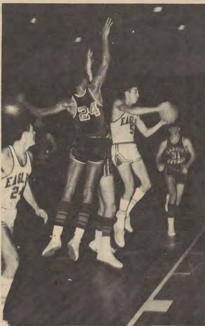
ROSE GIVES JORDAN PASS

explanations. It is not a shame to lose as long as you have tried as hard as possible. Take a defeat holding your head high. Be not only an athlete, be a sportsman.