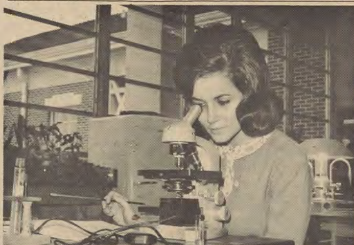
MISS GEORGIA PAGEANT ISN'T FAR OFF Miss GSC 1967 To Be Sponsored in Miss Georgia Pageant.

THE GEORGE-ANNE — Friday, February 10, 1967 — Page 6