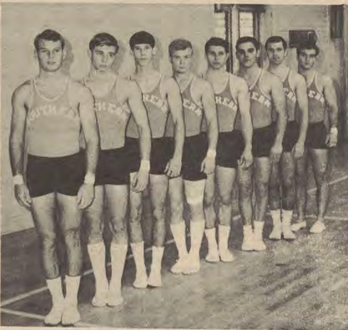
EAGLE GYMNASTS LINE UP

The Southern JV basketball team fell, 76-74, to the freshman Bulldogs of the Citadel Wednesday at Charleston, S.C. The Citadel won the game on a last second basket.