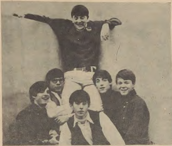
BRYLLIG AND THE NYMBOL SWABES Florida Group Slated to Perform at Saturday Dance