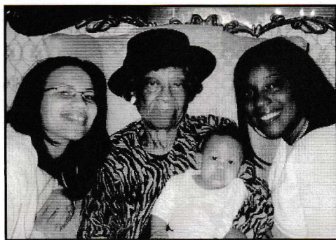
Past, Present, and Future; women of the family