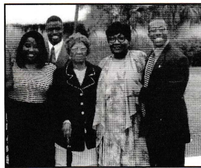
Mosell celebrating her granddaughter's graduation