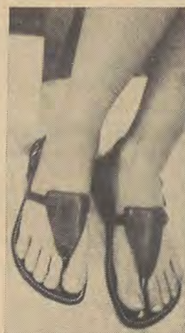
Brown Leather Thong