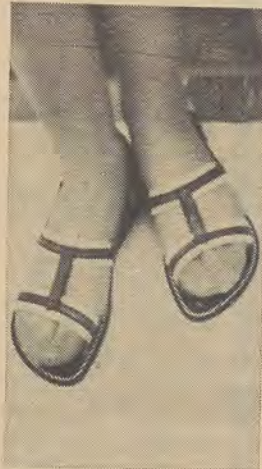
Two Strap Sandals with light Belgian Linen