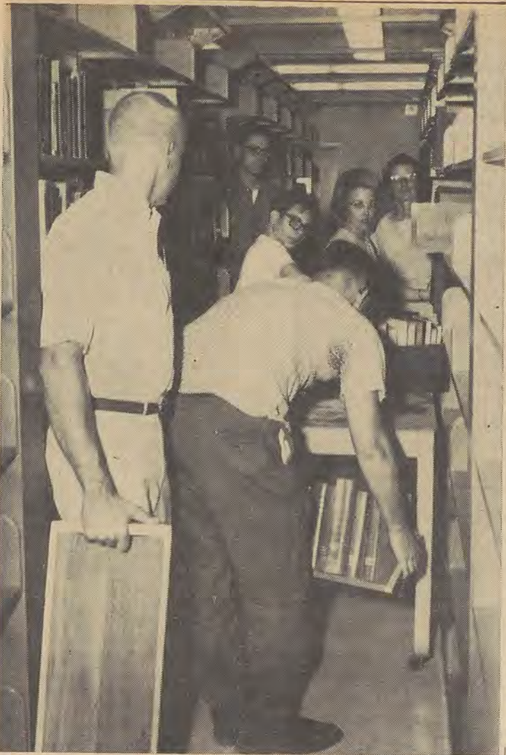
Circle K Club Places Library Books In New Annex Service Group Worked For 23 Hours On Massive Project