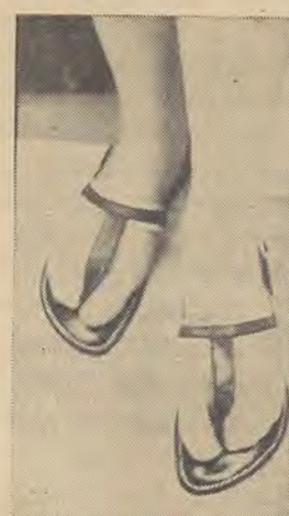
Thong with light Belgian Linen