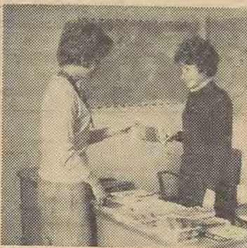
A payday in Europe can help

According to McCord, anyone is still eligible to join the debate team. Interested students should see him and attend the weekly meetings on Tuesday at 8 p.m. in room 3 of the Administration Building.