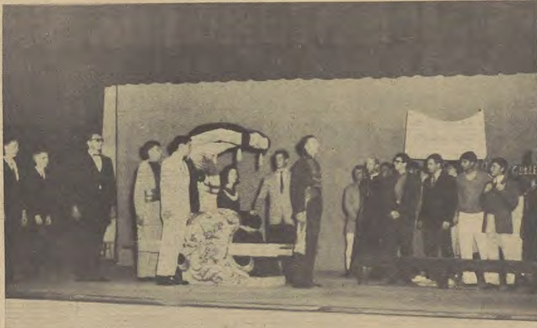
The Masquers first drama presentation of the year was presented last night in McCroan Auditorium and will continue tonight and tomorrow evening. "The Visit," a contemporary play by Friedrich Durrenmatt, is presented with a cast of 33 student actors and actresses. It is classified as 'adult entertainment' and it has not been advertised in the high schools.

Nominations for WHO'S WHO AMONG STUDENTS IN AMERICAN UNIVERSITIES AND COLLEGES should be based upon careful consideration of the prospective nominees' scholarship, leadership and cooperation in educational and extracurricular activities, general citizenship and promise of future usefulness in American Society. . .