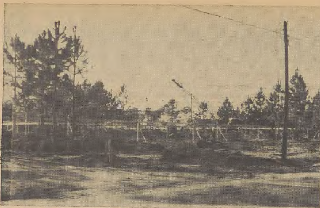
Construction has begun on the new 300 capacity women's dormitory being constructed on Georgia Avenue. Demetree Builders, Inc., are building the three-story structure. It will be constructed in the form of a court and will have complete air-conditioning. Completion date is set for one year.