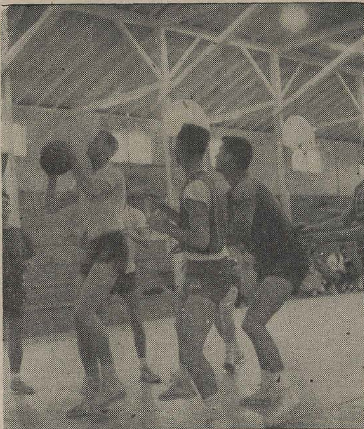
INTRAMURAL BASKETBALL is again underway on the GTC campus.