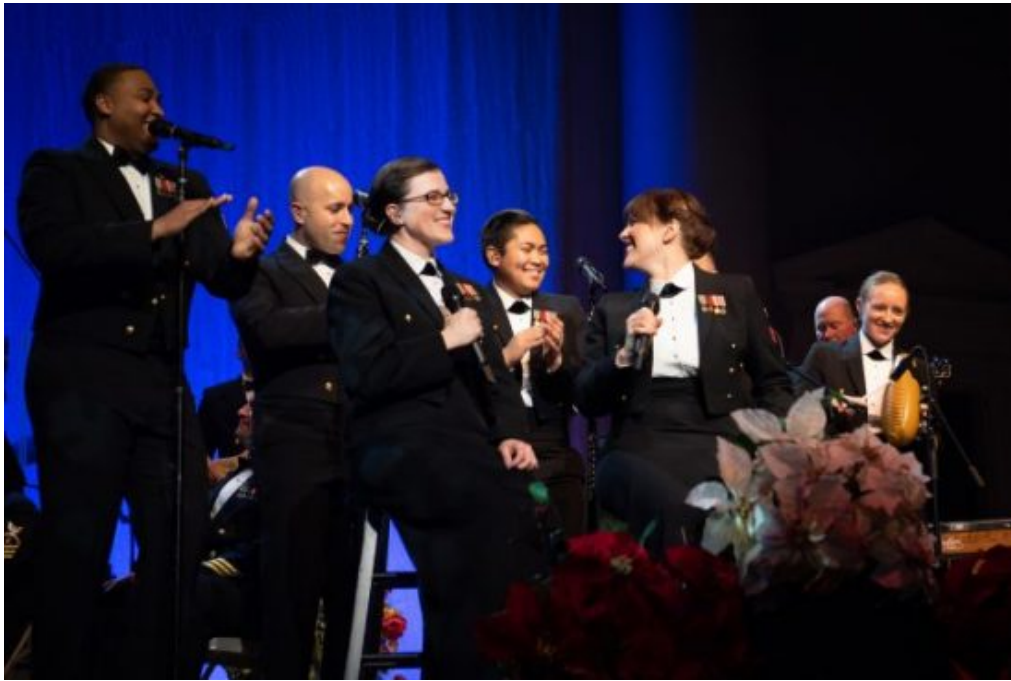
Musicians from the U.S. Navy Band perform at Constitution Hall during their annual holiday concert performance in Washington, D.C.

The United States Navy Band, the 2019 recipient of the National Medal of Arts, will perform on Georgia Southern University's Armstrong Campus on Feb. 28 at 7:30 p.m. in the Fine Arts Auditorium. The event is free and open to the public.