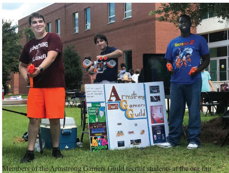
Members of the Armstrong Gamers Guild recruit students at the org fair.

The Eagles started off the season in style, but the focus will move to facing the UMass Minutemen on Saturday. The Eagles will be looking for revenge after UMass handled GSU last season 55-20 in Amherst. The game will be held at Paulson Stadium at 6:00p.m. with the Eagles looking to get their second win of the season in front of the home crowd.