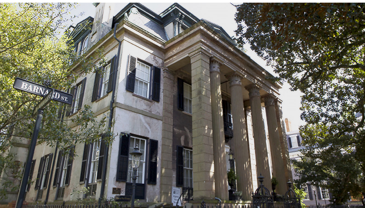
A daytime view of the house from Barnard Street.