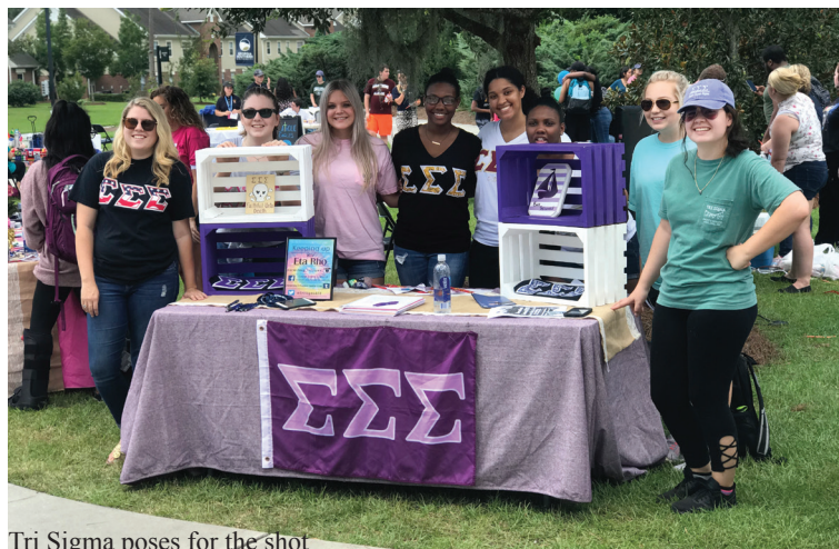
Tri Sigma poses for the shot