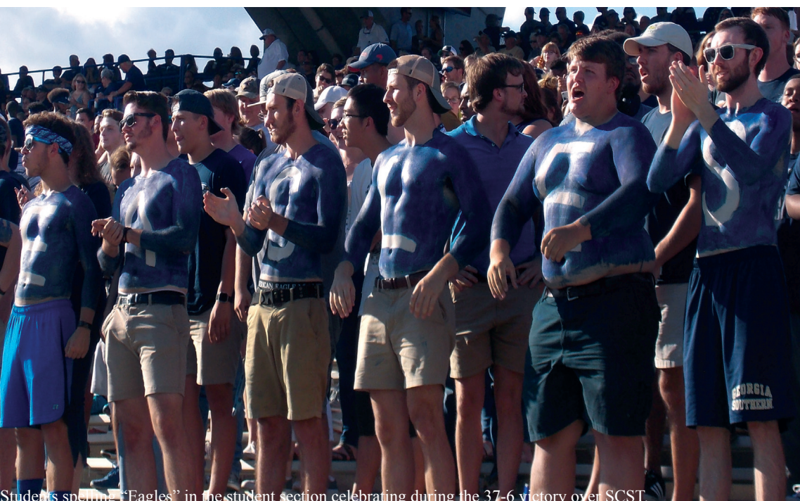
Students sporting "Eagles" in the student section celebrating during the 37-6 victory over SCST.