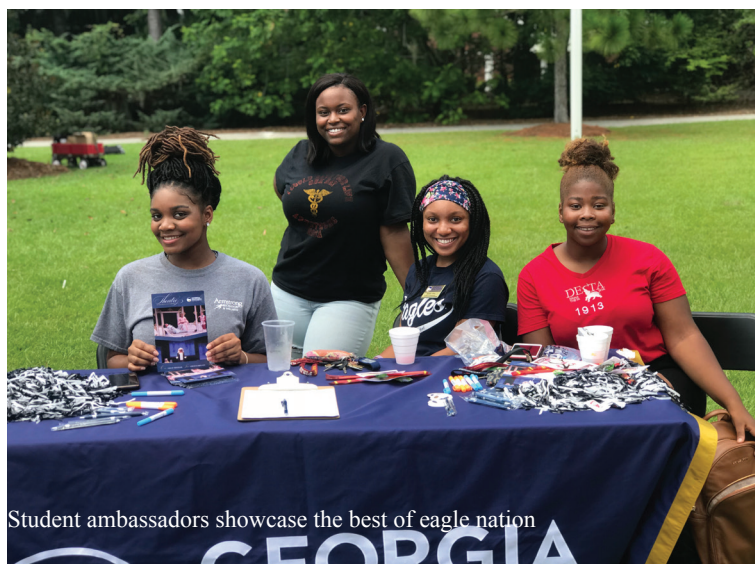
Student ambassadors showcase the best of eagle nation