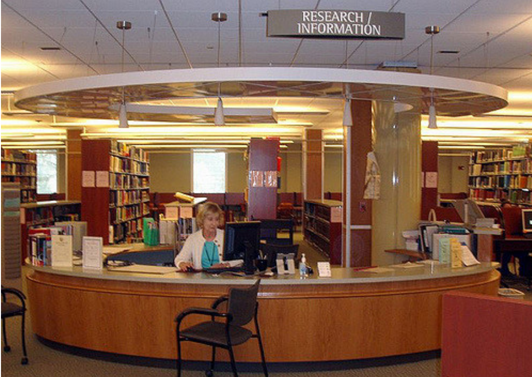
Pictured: Lane Library help desk (www.armstrong.edu).