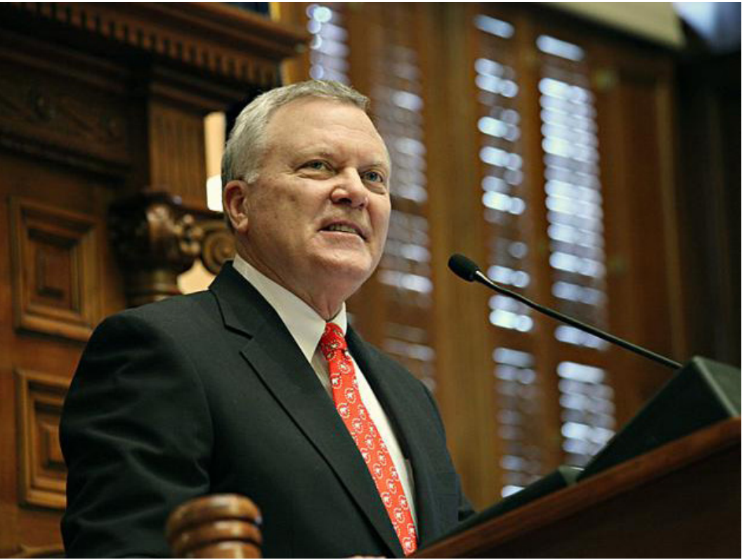
Governor Nathan Deal will decide whether or not to veto the “campus carry” gun bill in the next few weeks.