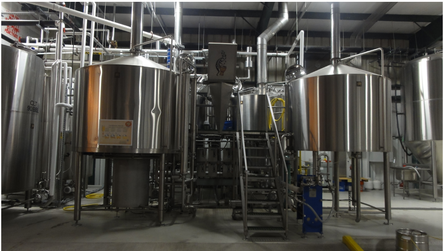
Vats of beer being brewed at the Southbound Brewery.