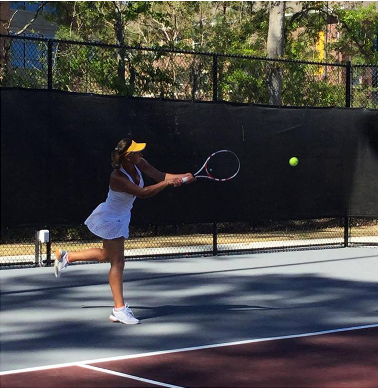
The tennis teams switched up their tactics during the most recent matches.

Another Peach Belt Conference home game will begin Friday, April 7 at 2 p.m. against University of North Georgia Nighthawks. Pirates will play Young Harris' Mountain Lions Saturday at 10 a.m. Sunday will be the last PBC game at the Armstrong Tennis Complex beginning at 10 a.m. Pirates will compete against the Lander University's Bearcats.