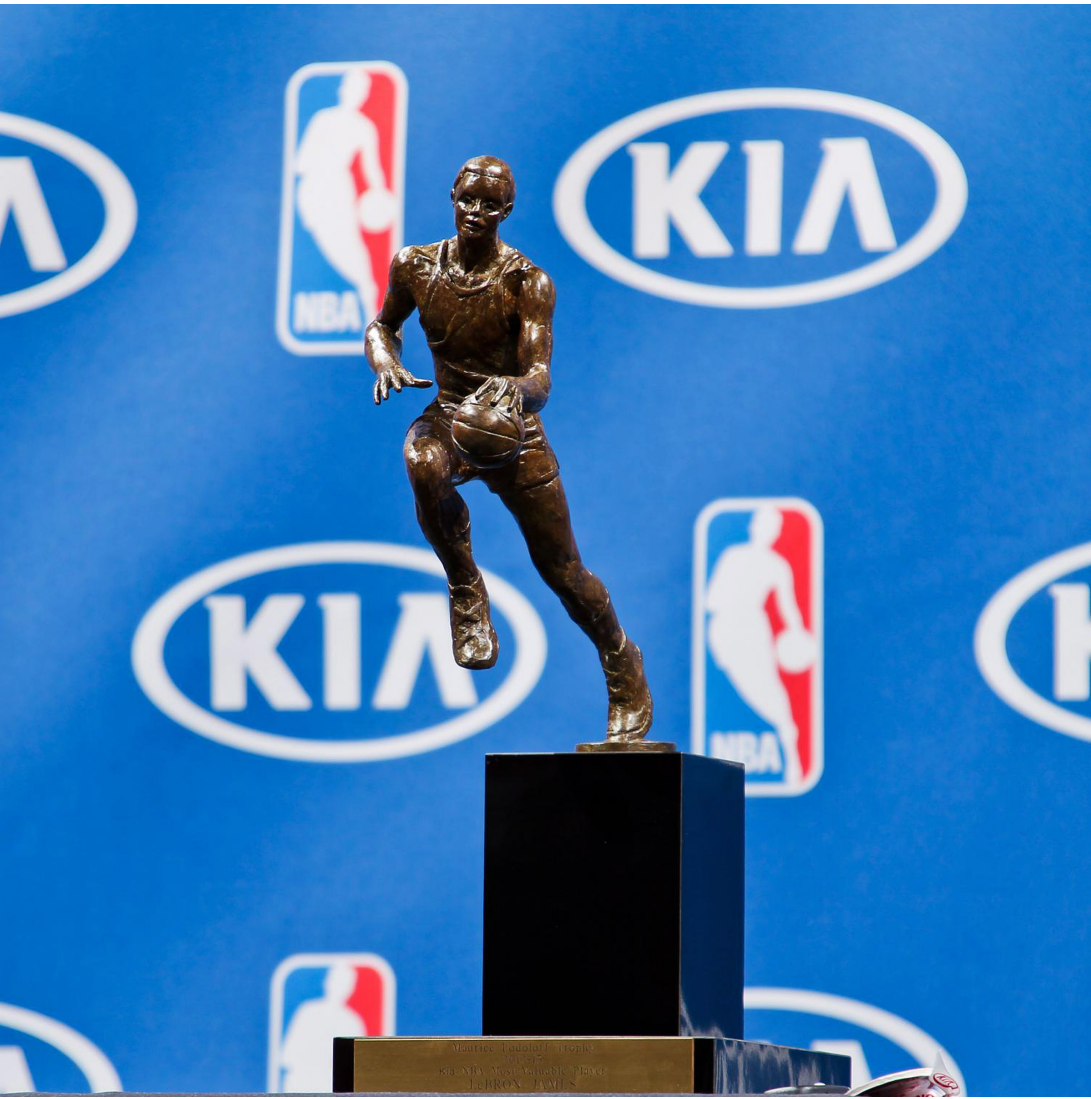
The Maurice Podoloff Trophy will be presented to the NBA's MVP.

When the NBA regular season comes to an end on April 14, voters will have a near impossible decision to make regarding the league's MVP.