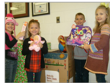
Carmel Elementary School — NSOC 2013 Woodstock, GA