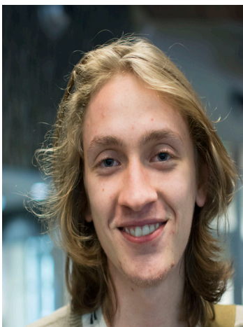
“Truthism, look it up.” Timmy Eller Art