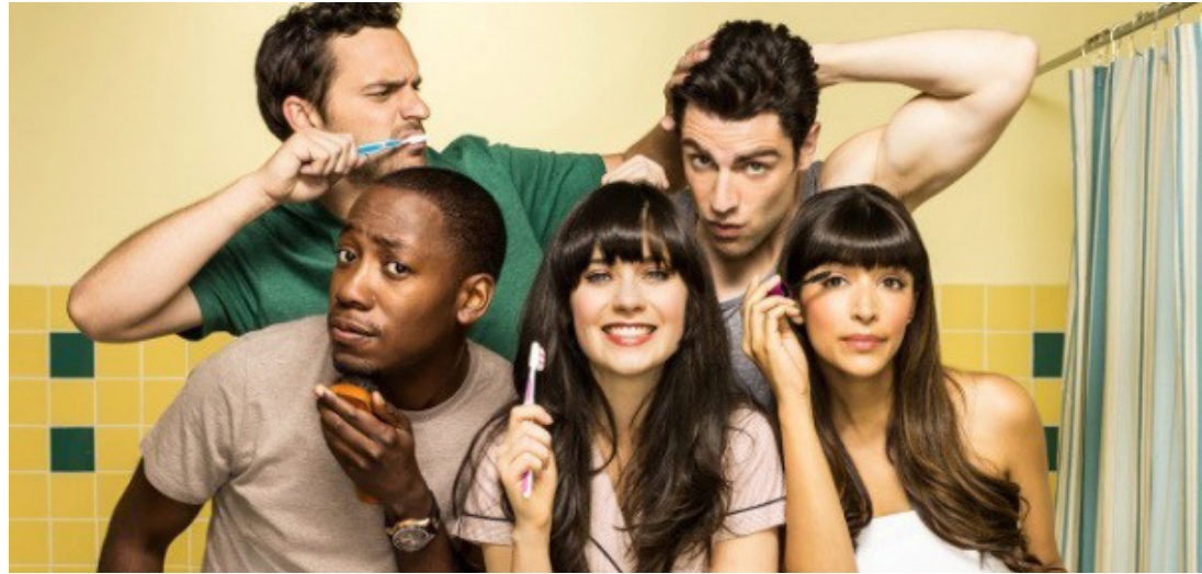
Promotional photo for the latest season of “New Girl.”