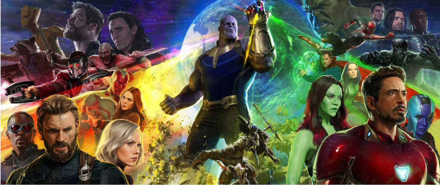
Promotional artwork for “Avengers: Infinity War.”

Why not take a break from all the studying and catch up on some shows, movies, and music! Let us know what you think and feel free to write for us!