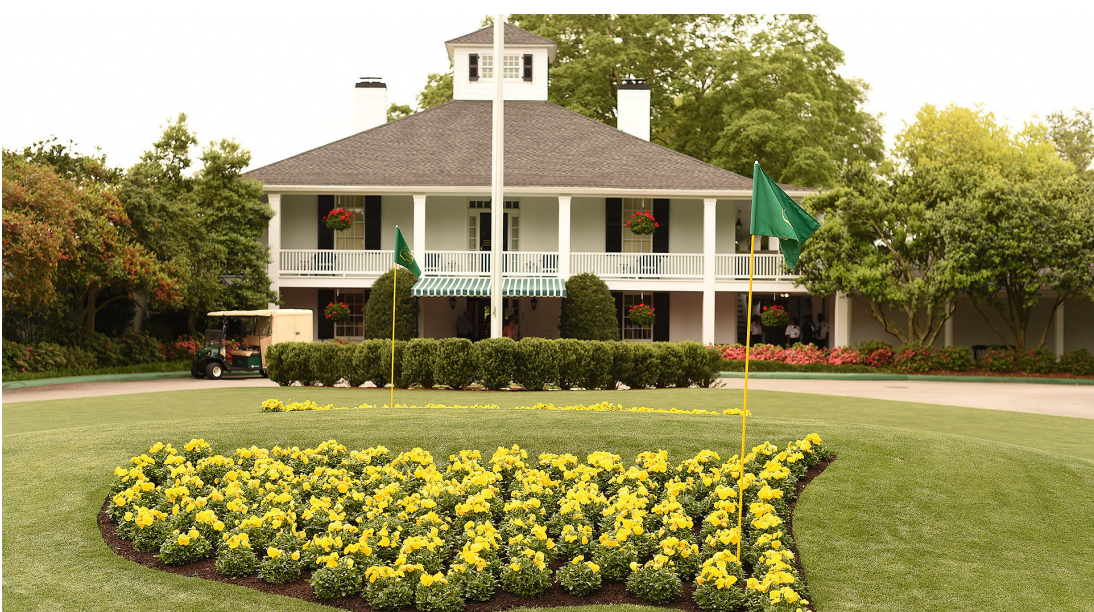
Augusta National Golf Club Clubhouse.

Tiger Woods. To be very simple, he seems to be getting back to his old form. Woods has four top 25 finishes in his last 5 events over the last three months, with his best finish being second place in the Valspar Championship. When Tiger is on his game, the sport of golf immediately gets better. His game is so smooth when he is on it, and due to his recent success, he is the betting favorite to win the tournament in Las Vegas, so Tiger Woods has the chip