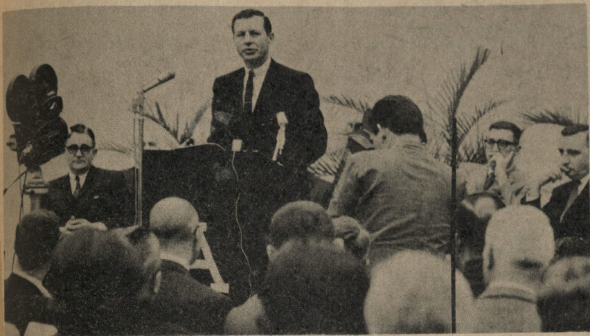
Governor Sanders addresses Armstrong at dedication ceremony