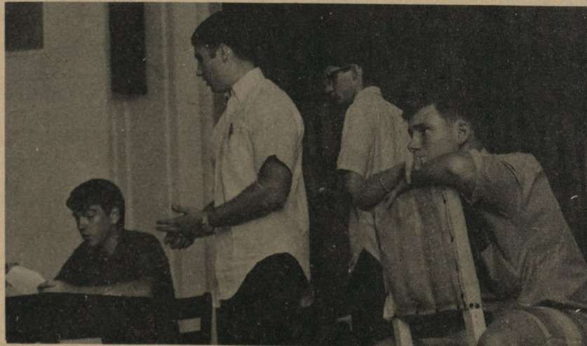
The Masquers rehearse