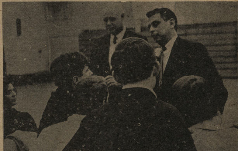
Students question de Toledano after his lecture.

De Toledano says that he is a "non-conformist conservative with general Republican sympathies. I derive my politics from a belief in God and the dignity of man."