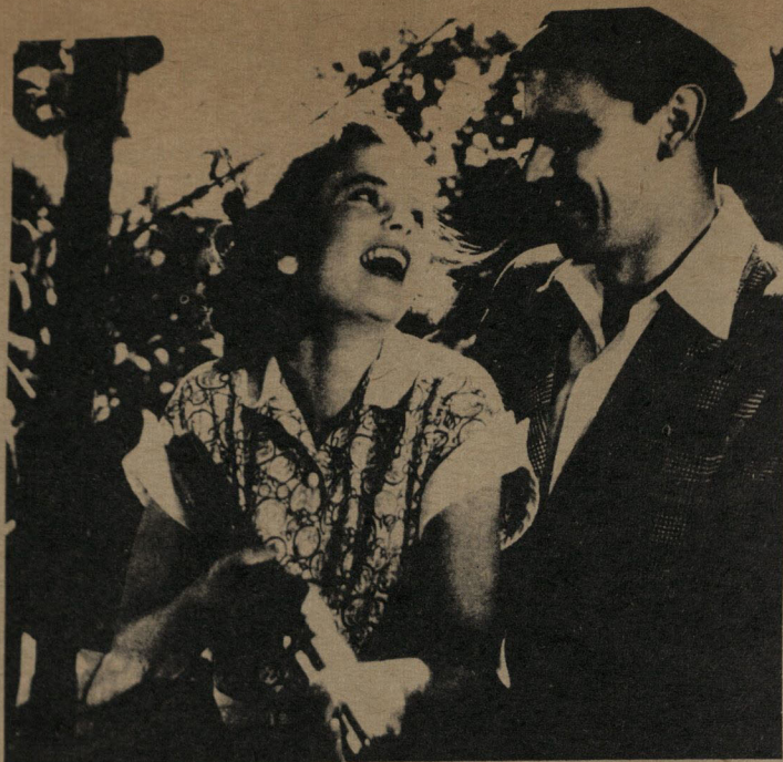
A scene from "One Summer of Happiness," to be shown tomorrow in the Fine Film Series.