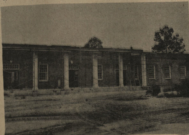
New budget cuts will halt campus construction.

Mitch Ryder will be followed by the Mangy Mountain Five in an April 31 concert.