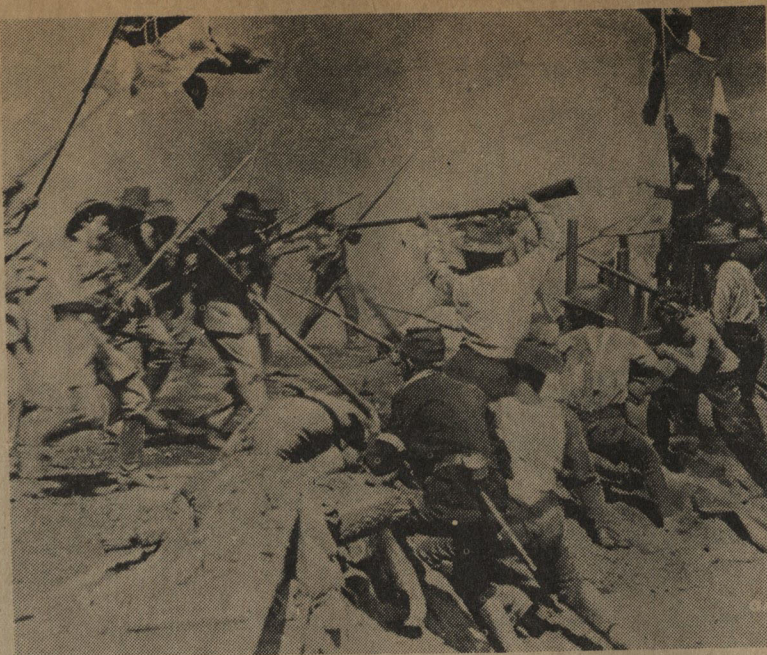
Young Democrats and Young Conservatives mix it up in an election year skirmish.

an advertisement sponsored by the friends of Piltdown