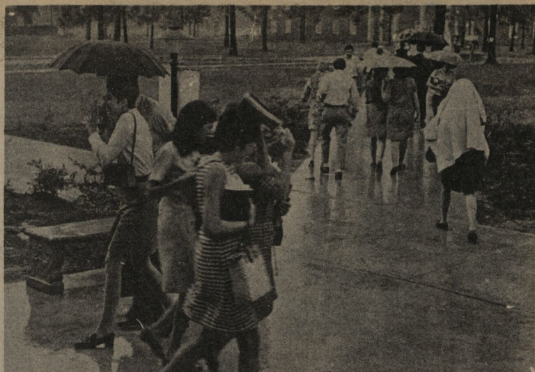
Armstrong students use various types of paraphernalia to dodge raindrops during a recent cloudburst that soaked the campus.

Other spokesmen criticized the over-all redundancy of the document. Dr. Hall announced that any suggestions for changes to the code should be submitted to members of the committee for consideration before the code is brought up for a vote. The committee itself will undergo a change. A faculty member who had been present at the faculty voting noted a