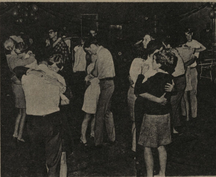
ASC students dance to the music of the Jokers Wild at one of the school's planned social functions. The dance was held at the Blessed Sacrament Gym.

After their preliminary speeches, the floor was open to students who had questions or gripes to air. The most prevalent displeasure concerned including offences which are covered by state and Federal law. Among those which come under the jurisdiction other than Armstrong's are the possession of firearms and explosives (section I, paragraph Bd),