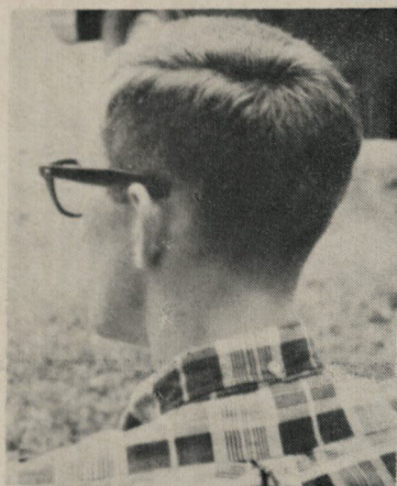
SPOTLIGHT Ordinary Student