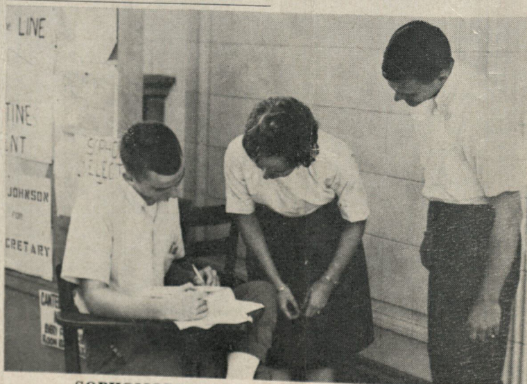
SOPHOMORES LINE UP TO CAST BALLOTS Booth in Armstrong Building kept busy.

Nearly all the candidates expressed surprise that the election campaign had been kept on such a high level.